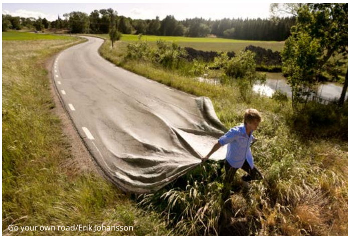
Go your own road/Erik Johansson

Read more: vastsverige.com/en/lacko-kinnekulle